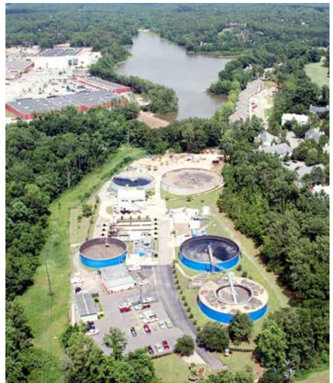
Figure 1. Daphne Utilities' Water Reclamation Facility had space limitations for new equipment